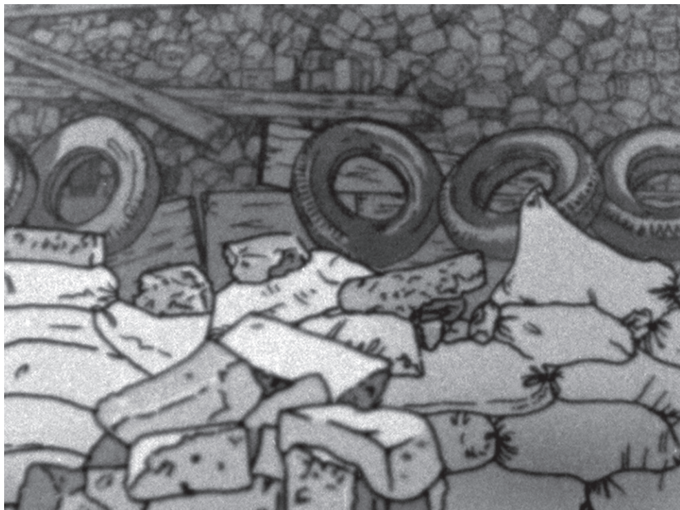
Still: Jean-Paul Kelly A Minimal Difference (2011)