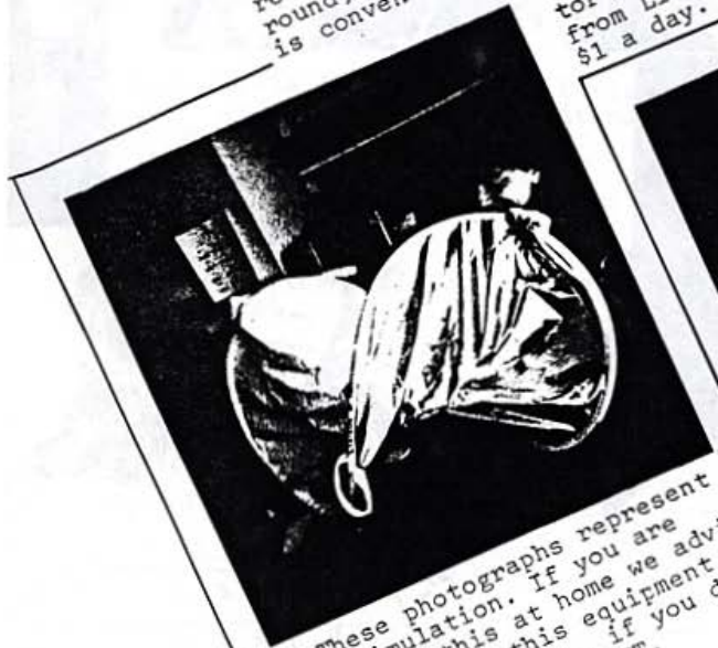
These photographs represent a simulation. If you are trying this at home we advise you handle this equipment with caution. Please, if you drink don't reflect. LIFT.